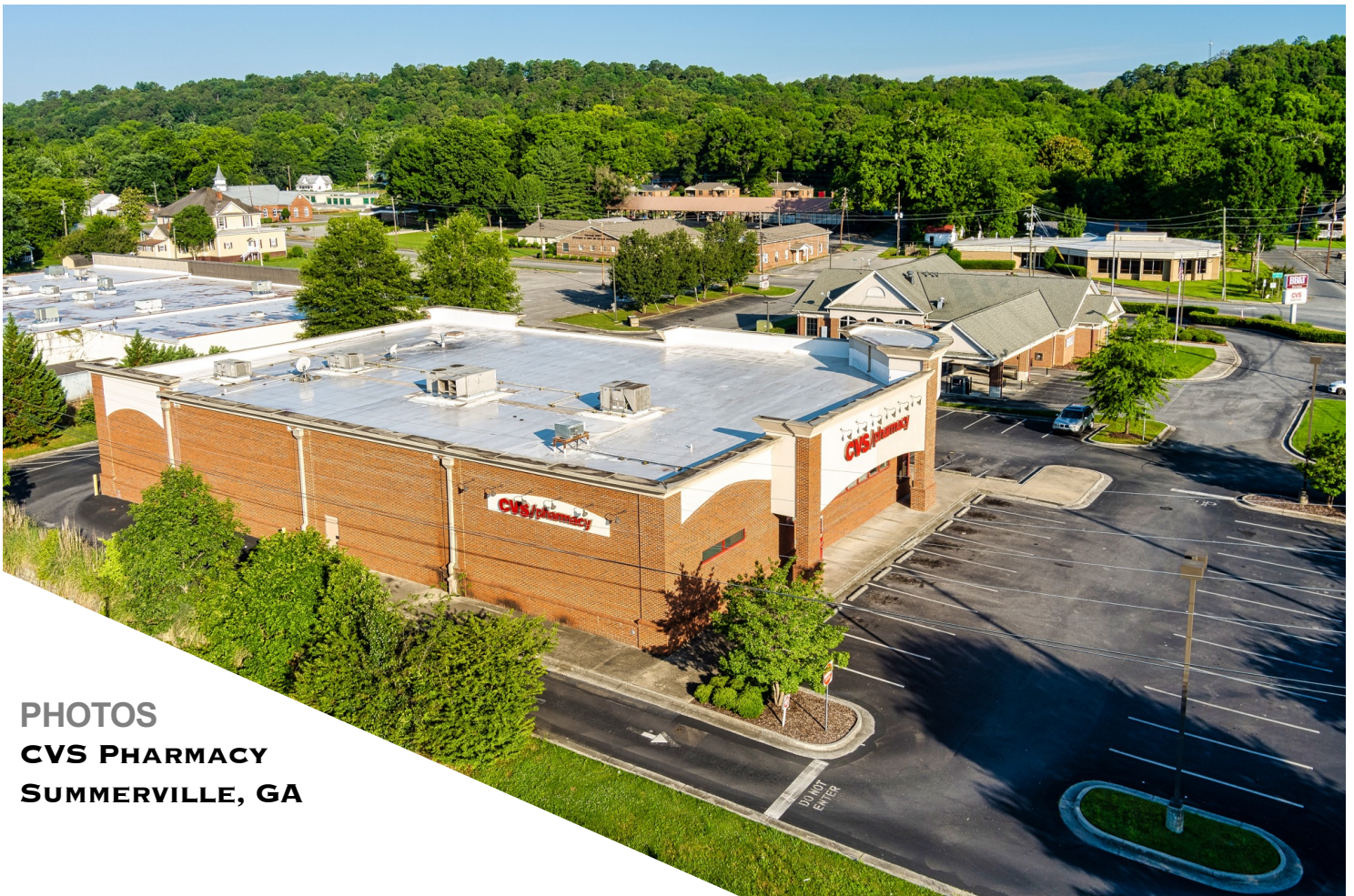
PHOTOS CVS PHARMACY SUMMERVILLE, GA